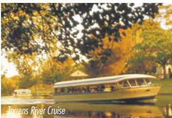
Torrens River Cruise

River cruise will not operate in extreme weather conditions. Hotel drop-offs are not available on this tour.