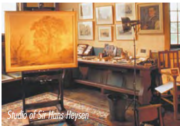
Studio of Sir Hans Heysen