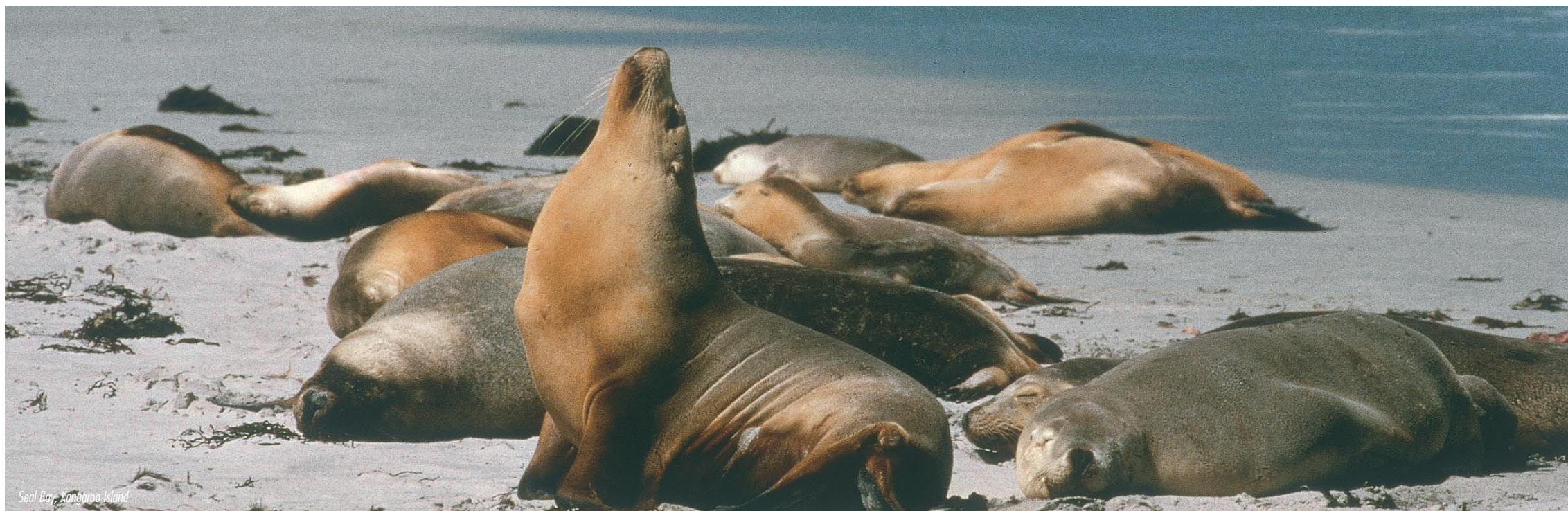
Seal Bay, Kangaroo Island

Operates: DAILY Departs: 6.45am Returns: 10.30pm approx