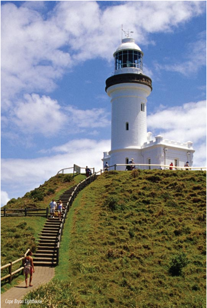
Cape Byron Lighthouse

Operates: MON, WED, FRI Departs 8.45am Gold Coast 7.30am Brisbane Returns: 5.00pm Gold Coast 6.00pm Brisbane