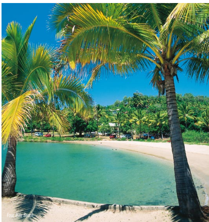
Four Mile Beach