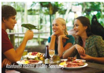
Rainforest Habitat Wildlife Sanctuary

Enquire at time of booking for hotel pick-ups