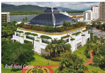
Reef Hotel Casino

Enquire at time of booking for hotel pick-ups.