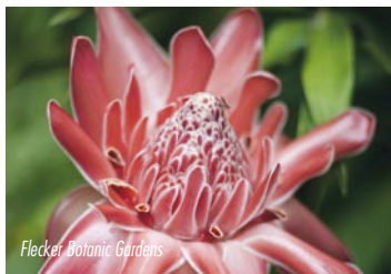
Flecker Botanic Gardens