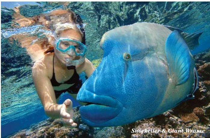
Snorkeller & Giant Wrasse