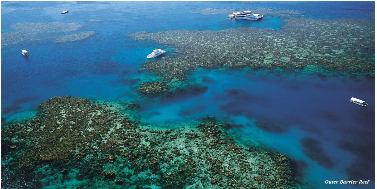
Outer Barrier Reef