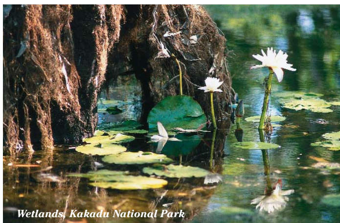
Wetlands, Kakadu National Park

This place is creation in its wonderful diversity... This place is Kakadu.