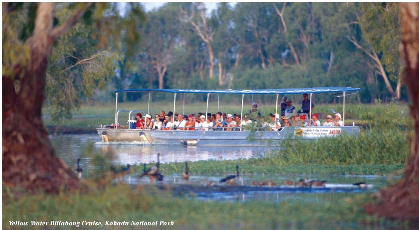
Yellow Water Billabong Cruise, Kakadu National Park