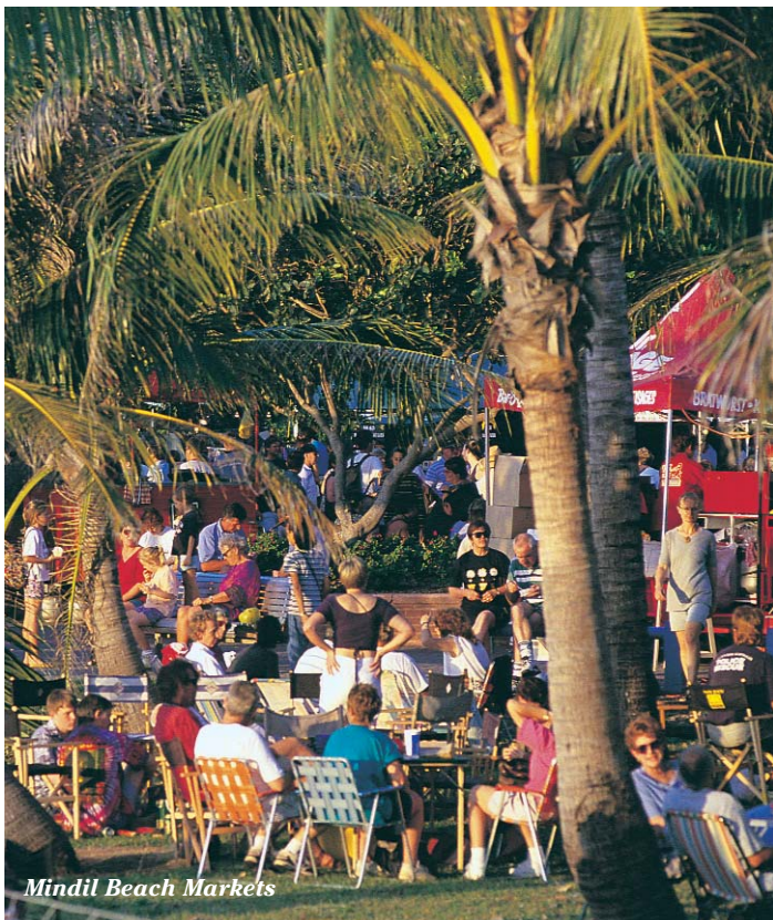
Mindil Beach Markets