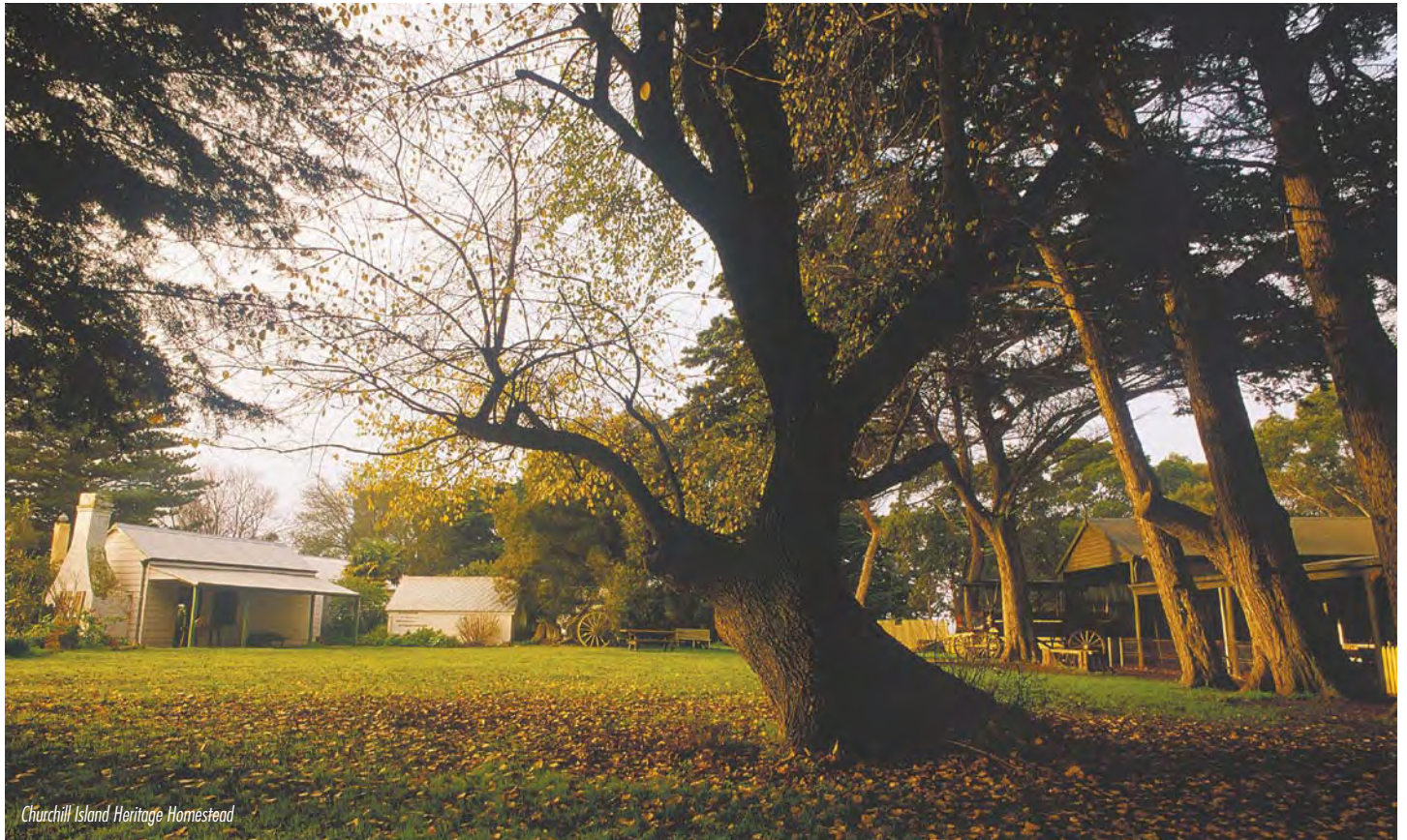
Churchill Island Heritage Homestead

Penguin Parade, Blue Dandenongs, Island Farm, Milk a Cow