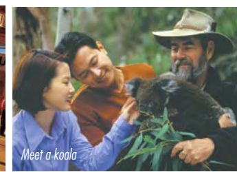
Meet a koala