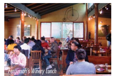
Fergusson's Winery Lunch