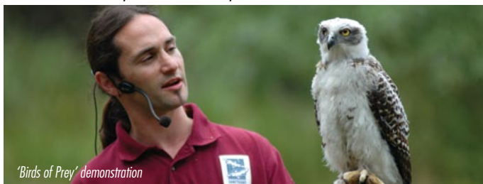
'Birds of Prey' demonstration

Ride on Australia's most notable narrow gauge railway through the spectacular Blue Dandenong Ranges with Bellbirds and Kookaburras echoing the steam train's whistle. Tour through the richness of the Yarra Valley - a pastoral experience of farms and vineyards, haystacks and wine grapes. Healesville Sanctuary - a truly Australian experience - cradled in the forested foothills of the Great Divide where you can surround yourself with Australian wildlife.