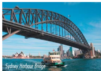
Sydney Harbour Bridge