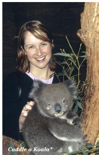
Cuddle a Koala*