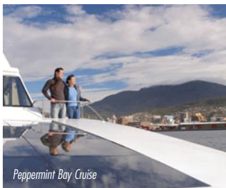
Peppermint Bay Cruise

Peppermint Bay is a stunning haven to unwind and invigorate. Why not return to Hobart on a spectacular cruise through magnificent and pristine waterways from Peppermint Bay?